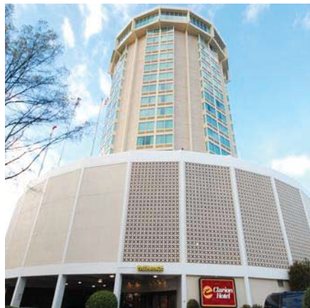
Clarion Hotel in Raleigh, North Carolina.

A complete list of authors and titles, along with their abstracts is on pages 5-8.